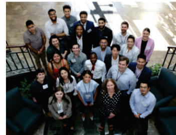
The 2022 Diversity Clerkship Program participants.

First-year Marquette University Law School and University of Wisconsin Law School students with backgrounds that have been historically excluded from the legal field who are in good standing may apply. Successful applicants demonstrate a commitment to diversity and a record of academic achievement.