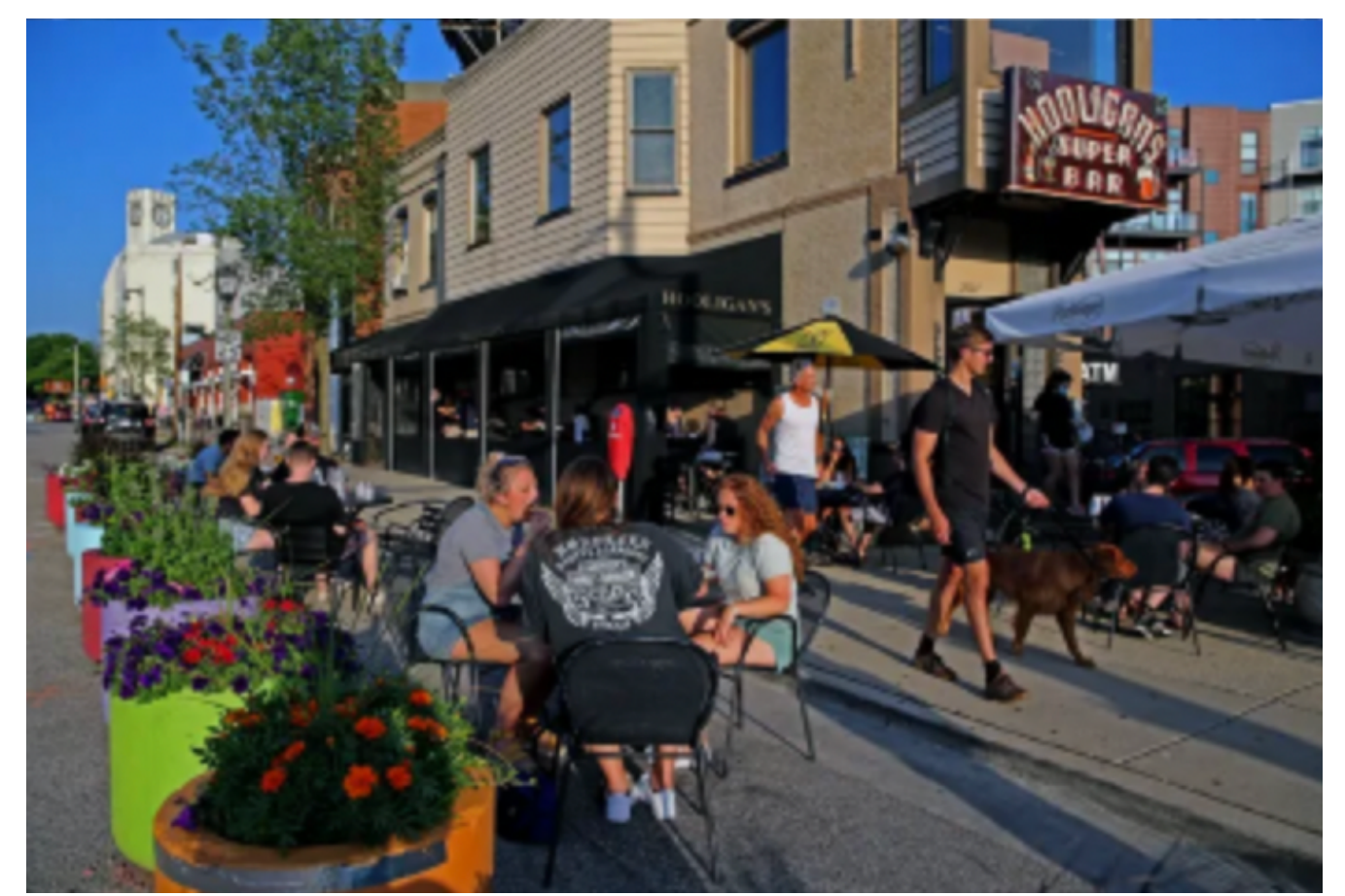
Repurposing Street Space