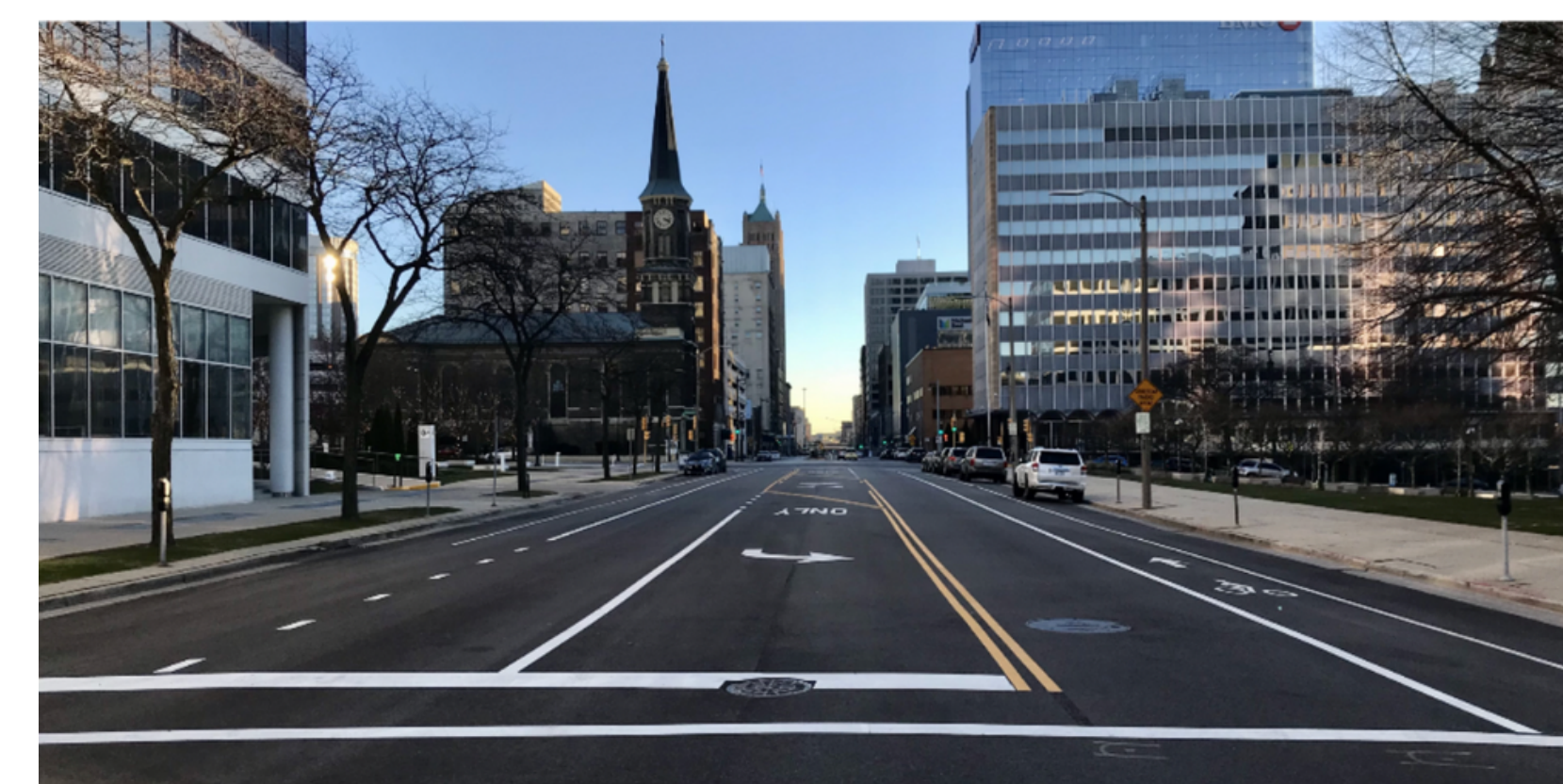
Restriping through High Impact Paving