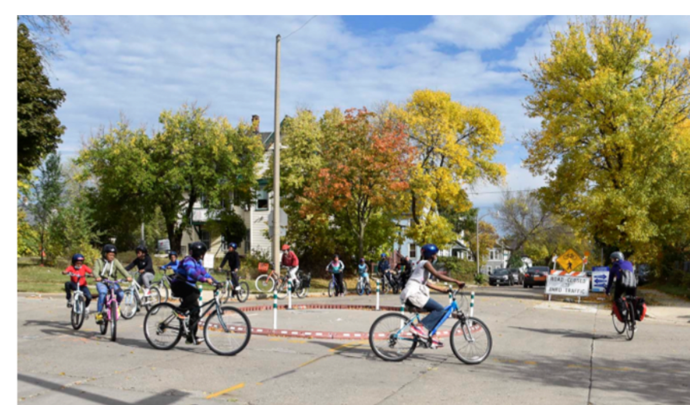
Traffic Circle on W. Galena Street (Active Streets)