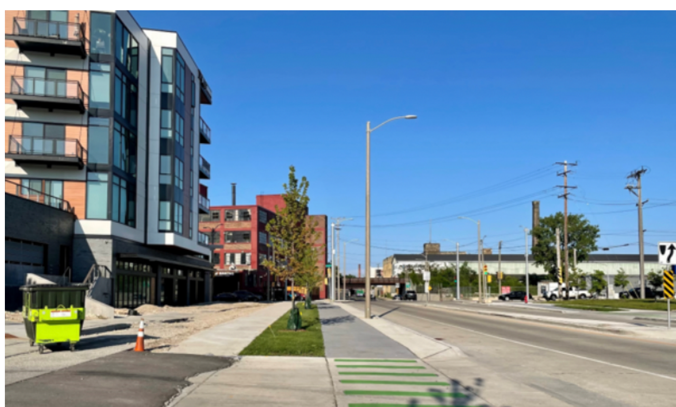
W. Becher Street Raised Bike Lanes